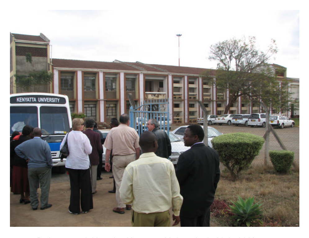
Delegates visiting the Kenyatta University in Nairobi Kenya