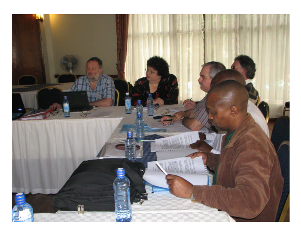
Delegates participating at the workshop in Nairobi, Kenya