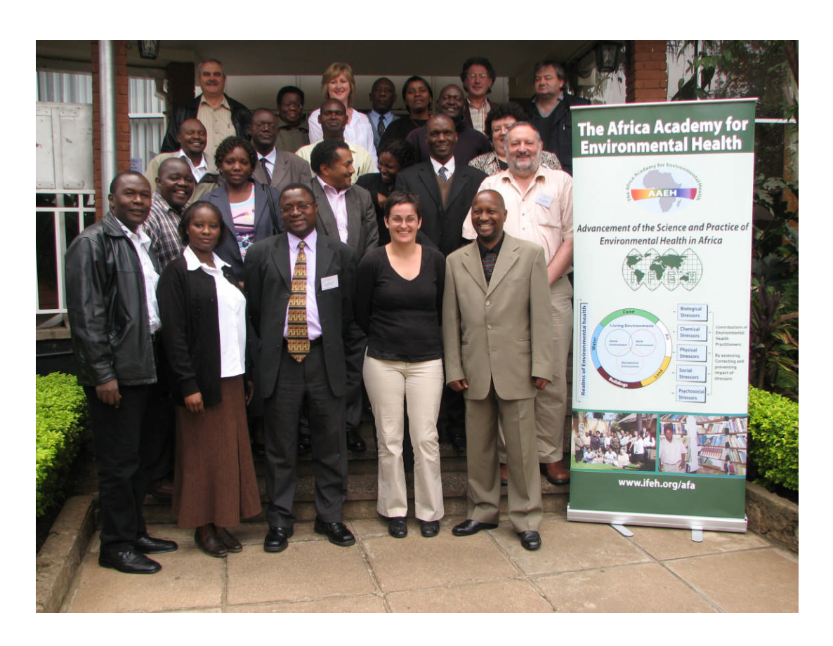
Workshop delegates that participated at the Nairobi workshop